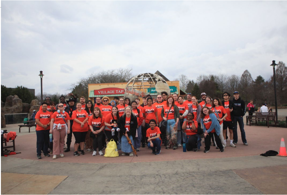
A group of people posing for a photo in matching t-shirts