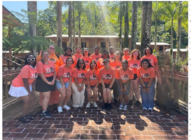
A group of students posing for a photo in matching t-shirts