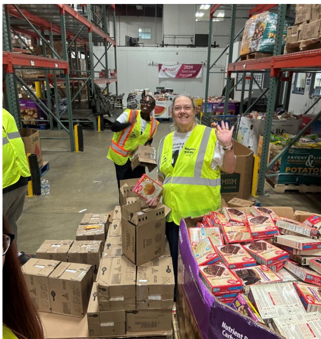
Volunteers waving in front of pallet of food

To highlight the significance of TRIO's impact and demonstrate a shared commitment to service, Purdue Fort Wayne's TRIO SSS program and Ivy Tech's TRIO SSS program collaborated to support Community Harvest Food Bank. This nonprofit organization serves communities, families, and individuals throughout Allen County and the surrounding areas by addressing food insecurity through a variety of programs. Each year, Community Harvest Food Bank collects, organizes, and distributes millions of pounds of food to those in need. However, such as extraordinary effort is only possible with the help of dedicated volunteers. Food must be carefully inspected, sorted, organized, and distributed to ensure it reaches individuals and families efficiently and safely. Working with the employees and volunteers of Community Harvest Food Bank was an enriching opportunity for all involved and allowed TRIO SSS to do what it does best, continuing to help others in need.