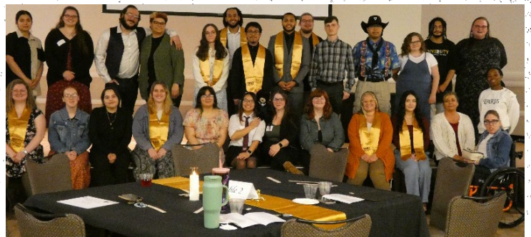
A group of people posing for a photo