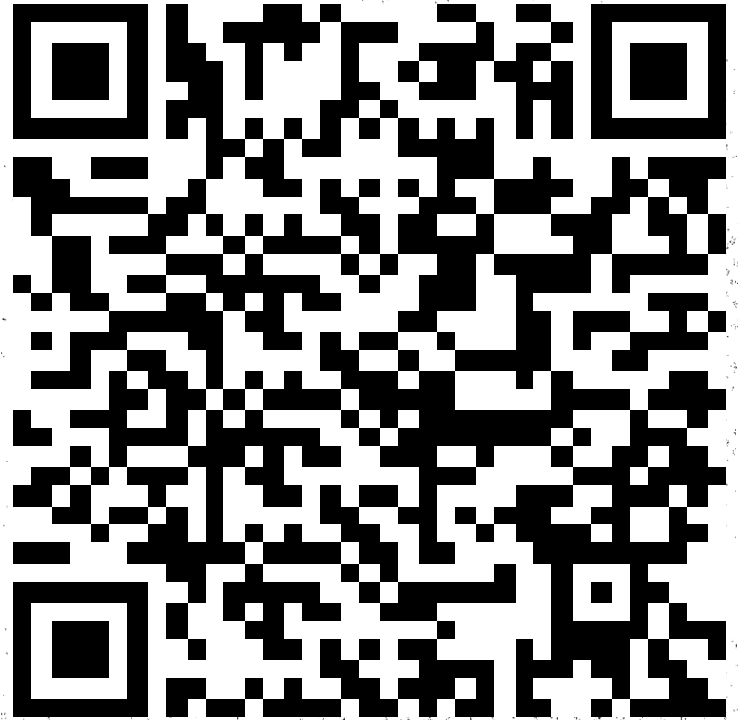
QR Code for TRIO SSS Alumni Survey

Scan the QR Code to submit your testimonial. Your experience can inspire current students, inform others of how #TRIOWorks, and demonstrate the life-changing impact of TRIO Student Support Services at Purdue University Fort Wayne.