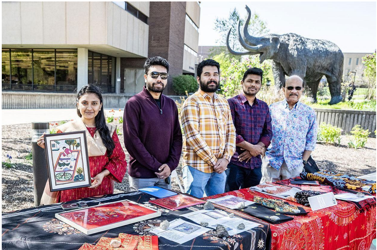
Representatives of the Bangladesh Student Organization displayed some handmade items at the annual Asian American and Pacific Islander Heritage Fest on April 22.