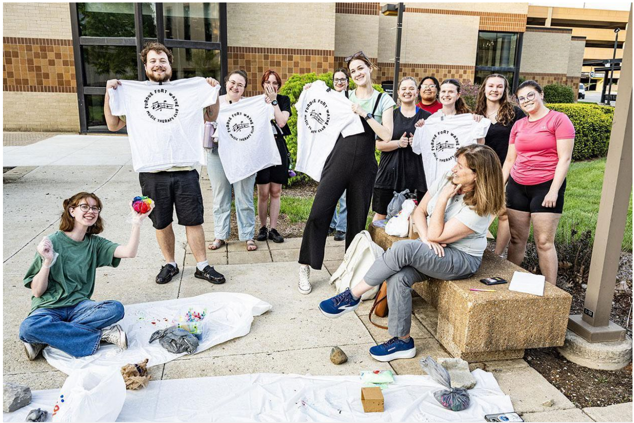
Music therapy students met outside in the Arts Plaza on Thursday to tie-dye some namesake T-shirts.

Seen and noted around campus. Monitor our university social feeds for more great moments of Mastodon life.