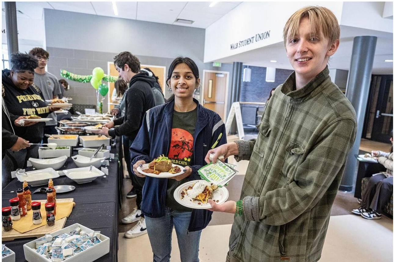
It wouldn't be St. Patrick's Day without the annual SAB St. Paddy's Potato Bar, served up near the north end of the skybridge.