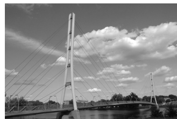
Venderly Family Bridge