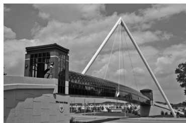
Willis Family Bridge

Indiana University–Purdue University Fort Wayne has been transformed by its outreach as well as a brick and mortar metamorphosis during the past 10 years. Capturing the vision of IPFW, the two uniquely designed pedestrian bridges link the university to the community, promoting engagement. These first of five planned “Bridges of Learning” symbolize the university’s commitment to the community.