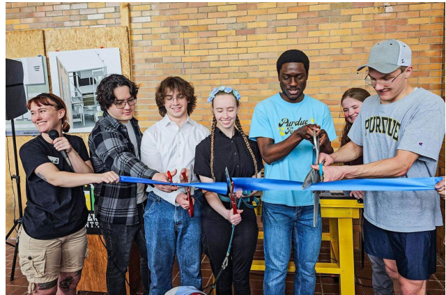
Engineering Students Beat the Clock to Help Science Central Add New Exhibit (June 3)

Don Life is an official university communication sent weekly on Wednesday to all currently enrolled students. Don Life Special Edition is a supplement to the regularly scheduled newsletter. It covers breaking news and time-sensitive information directly related to university operations.