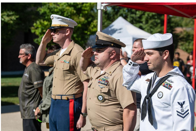
PFW Earns State Recognition for Its Support of Military-Affiliated Students (July 3)