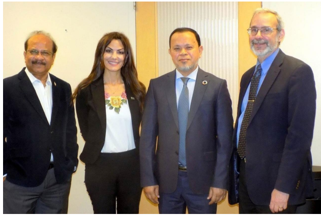
Daffodil International University Collaboration with PFW Honors Program Sparks Return Trips to Each Campus (June 10)