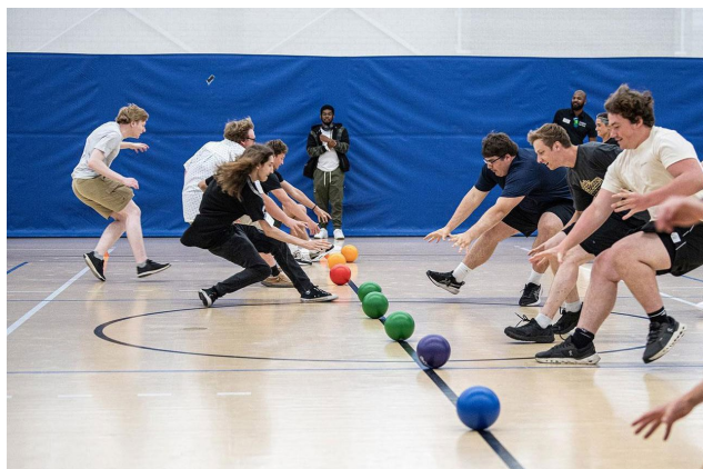
NSO Overnights Help Students Form Stronger Bond with PFW and Each Other (July 1)