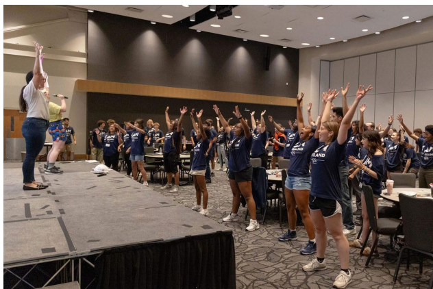
PFW Student Help Youth Summit Participants See the Possibilities (June 10)