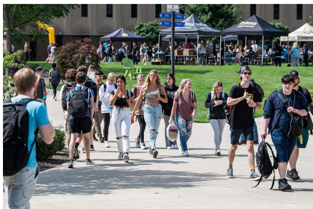
5 Tips for the Future College Student (July 8)