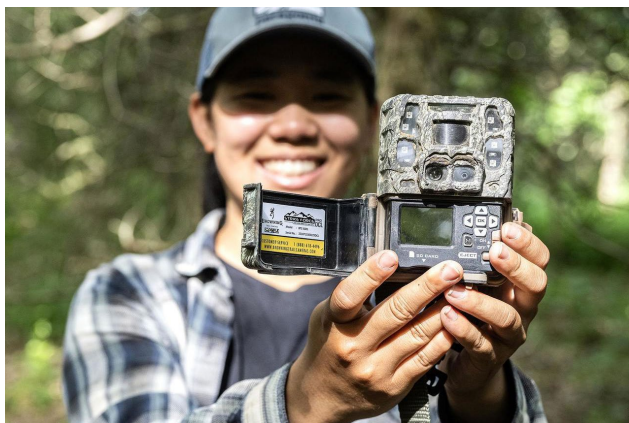
Purdue Fort Wayne Graduate Student Crisscrosses Indiana to Study Small Mammal Population (July 17)