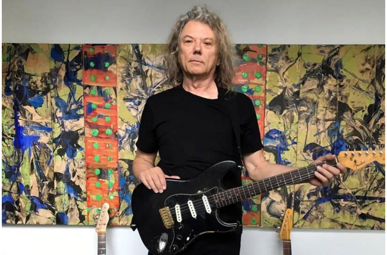
Talking Heads band member Jerry Harrison