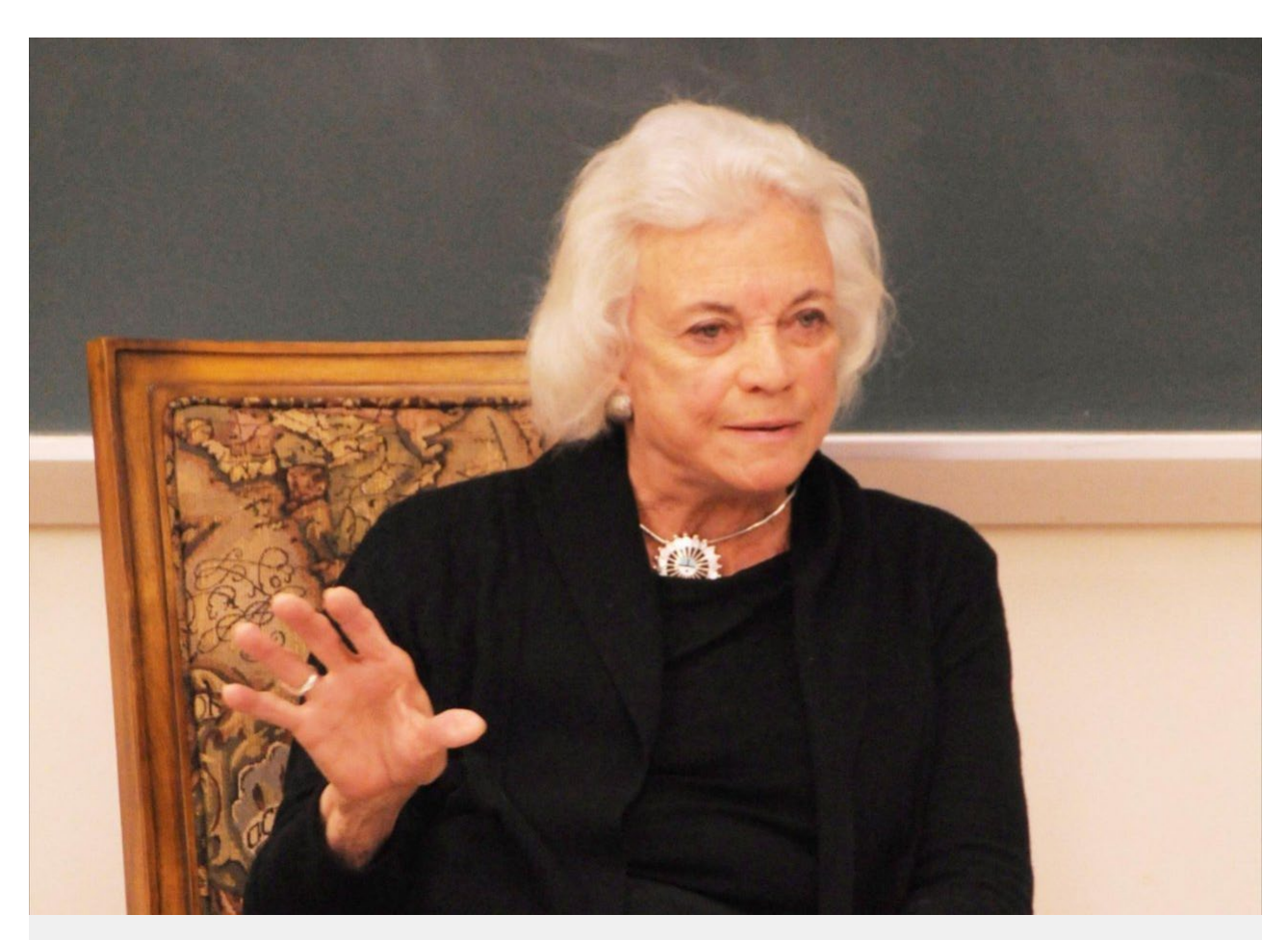
Retired Supreme Court Justice Sandra Day O'Connor was one of six guest speakers during the 2008–2009 Omnibus season.