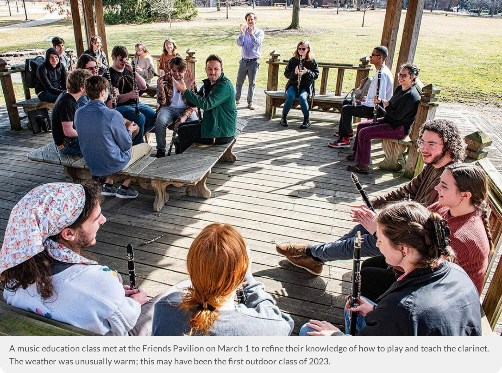
A music education class met at the Friends Pavilion on March 1 to refine their knowledge of how to play and teach the clarinet. The weather was unusually warm; this may have been the first outdoor class of 2023.