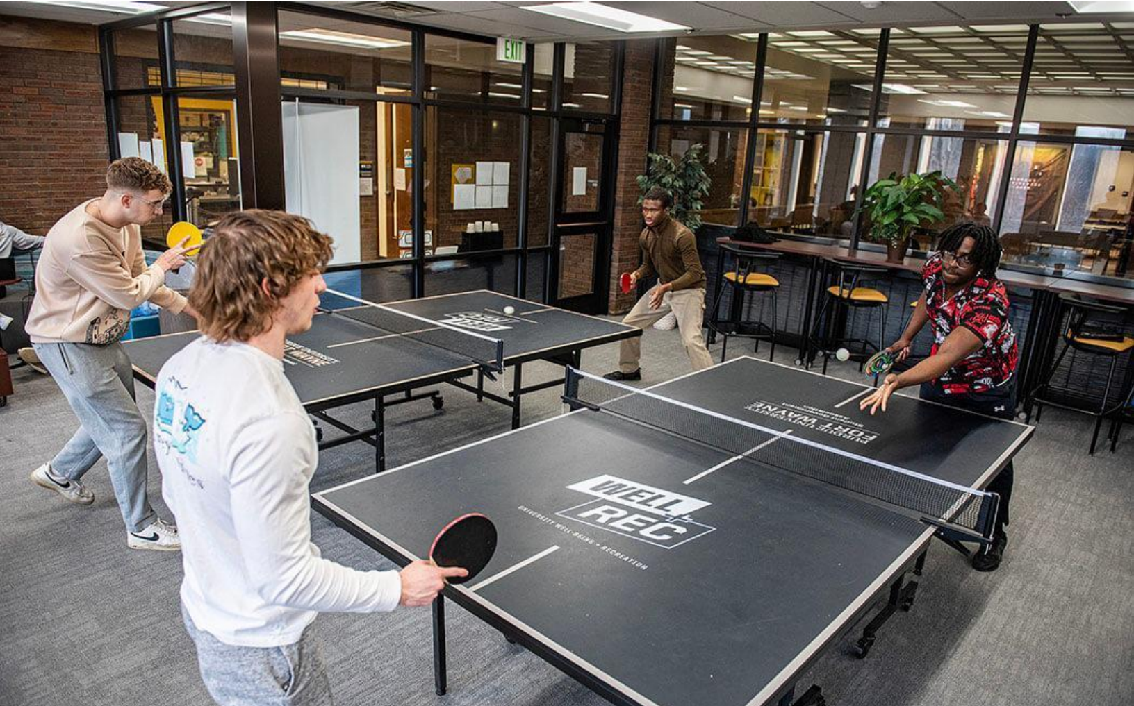
The competition was intense last week during WellRec's "Ping-Pong Palooza" table tennis tournament, held in the Walb Student Union Gaming Lounge.