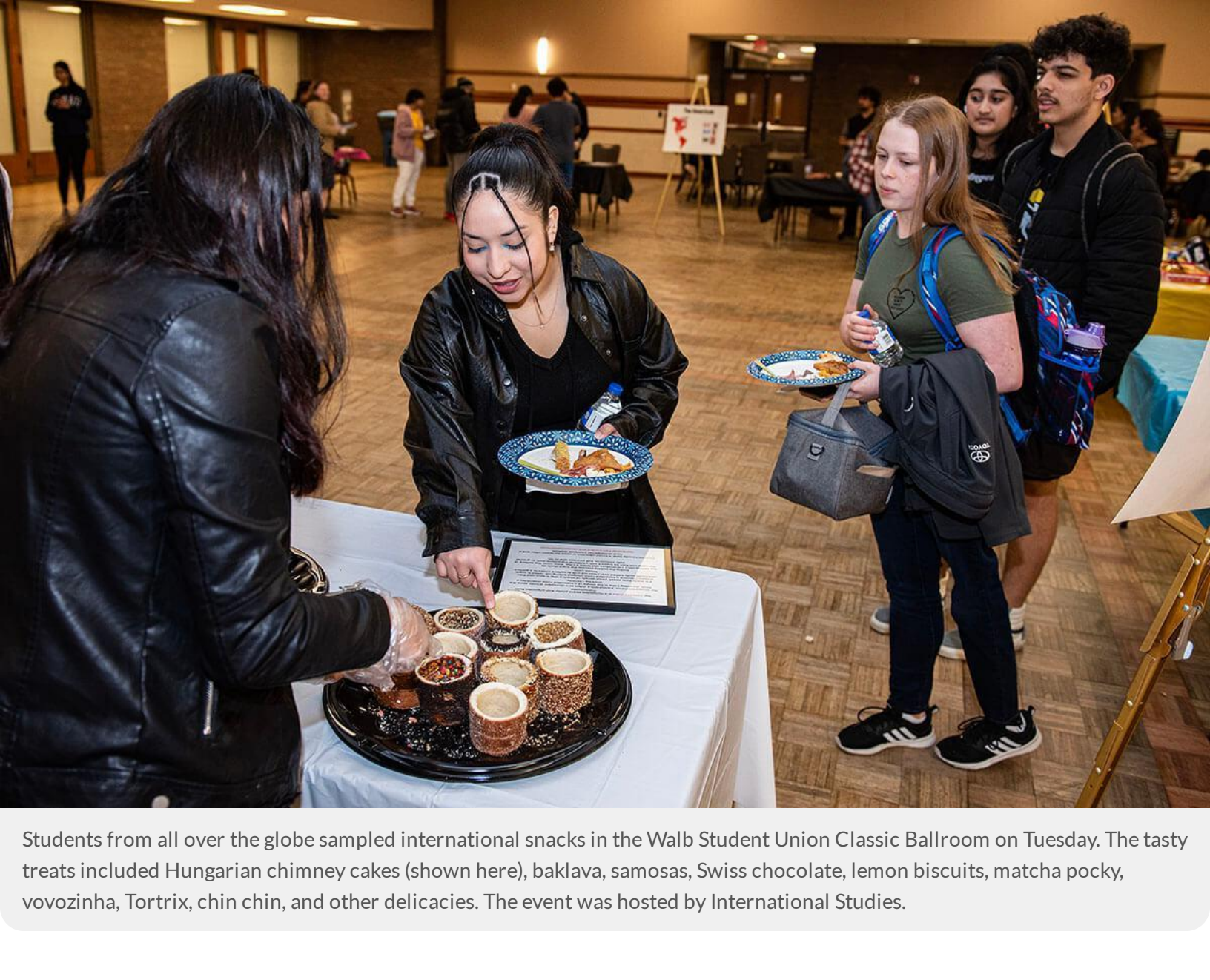
Students from all over the globe sampled international snacks in the Walb Student Union Classic Ballroom on Tuesday. The tasty treats included Hungarian chimney cakes (shown here), baklava, samosas, Swiss chocolate, lemon biscuits, matcha pocky, vovozinha, Tortrix, chin chin, and other delicacies. The event was hosted by International Studies.