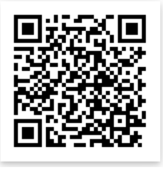
Study Abroad Scholarship Fund