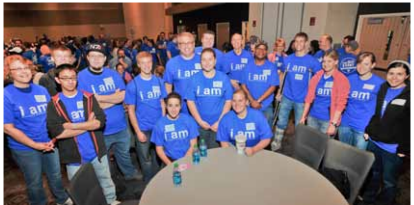
We are very proud of the CEIT team!

The CEIT department put out a call for volunteers and 29 students, professors, staff, and supportive family members committed to making Fort Wayne a nicer place on March 24, 2012. The department, along with the Radiology Team, was assigned to the Boys and Girls Club on Fairfield Avenue.