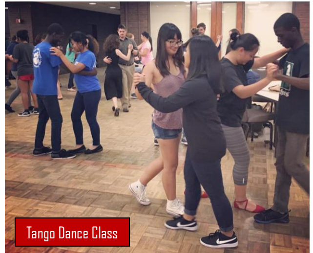
Tango Dance Class