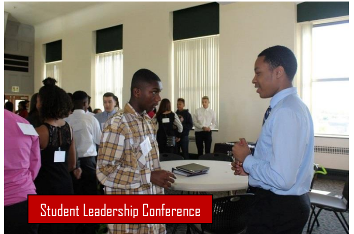
Student Leadership Conference