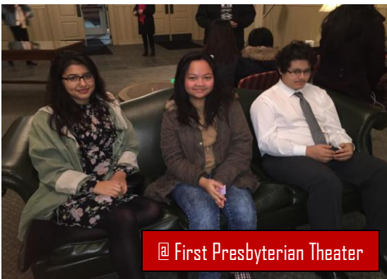
@ First Presbyterian Theater