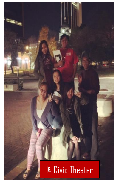
@ Civic Theater