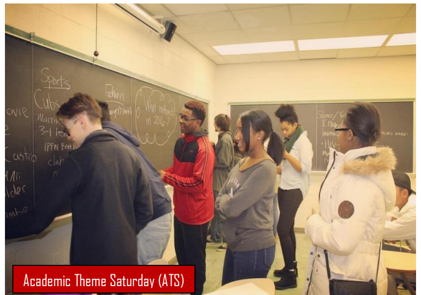
Academic Theme Saturday (ATS)