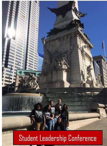
Student Leadership Conference