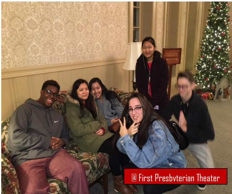
@ First Presbyterian Theater