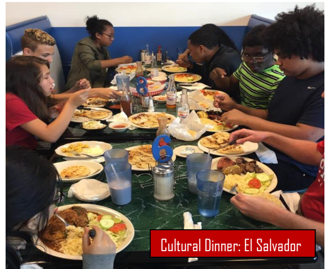
Cultural Dinner: El Salvador